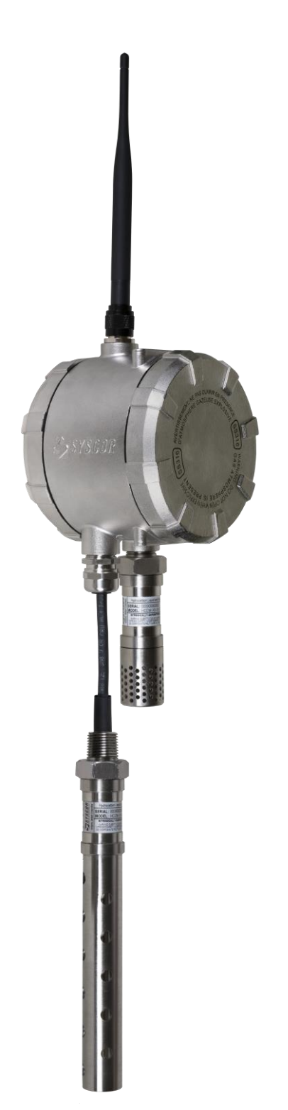
*Field Transmitter PCU with HCD and HCDW sensor transducers and rigid monopole antenna